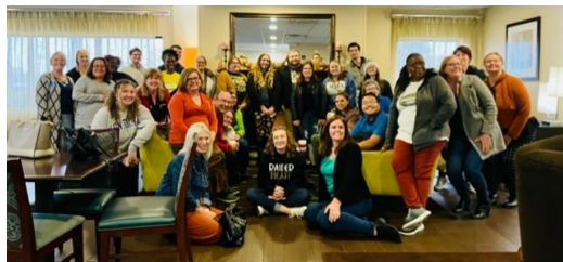
Top: Swearing In Ceremony Bottom: KyCC Coaches and Staff